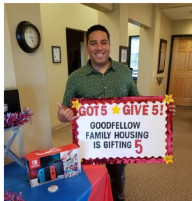
GRAND PRIZE WINNER! NINTENDO SWITCH