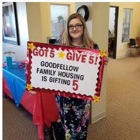
AMAZON ECHO WINNER