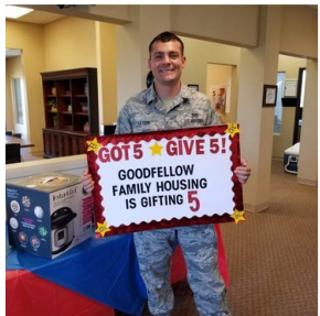
INSTANT POT WINNER!

Congratulations to all of our drawing winners!